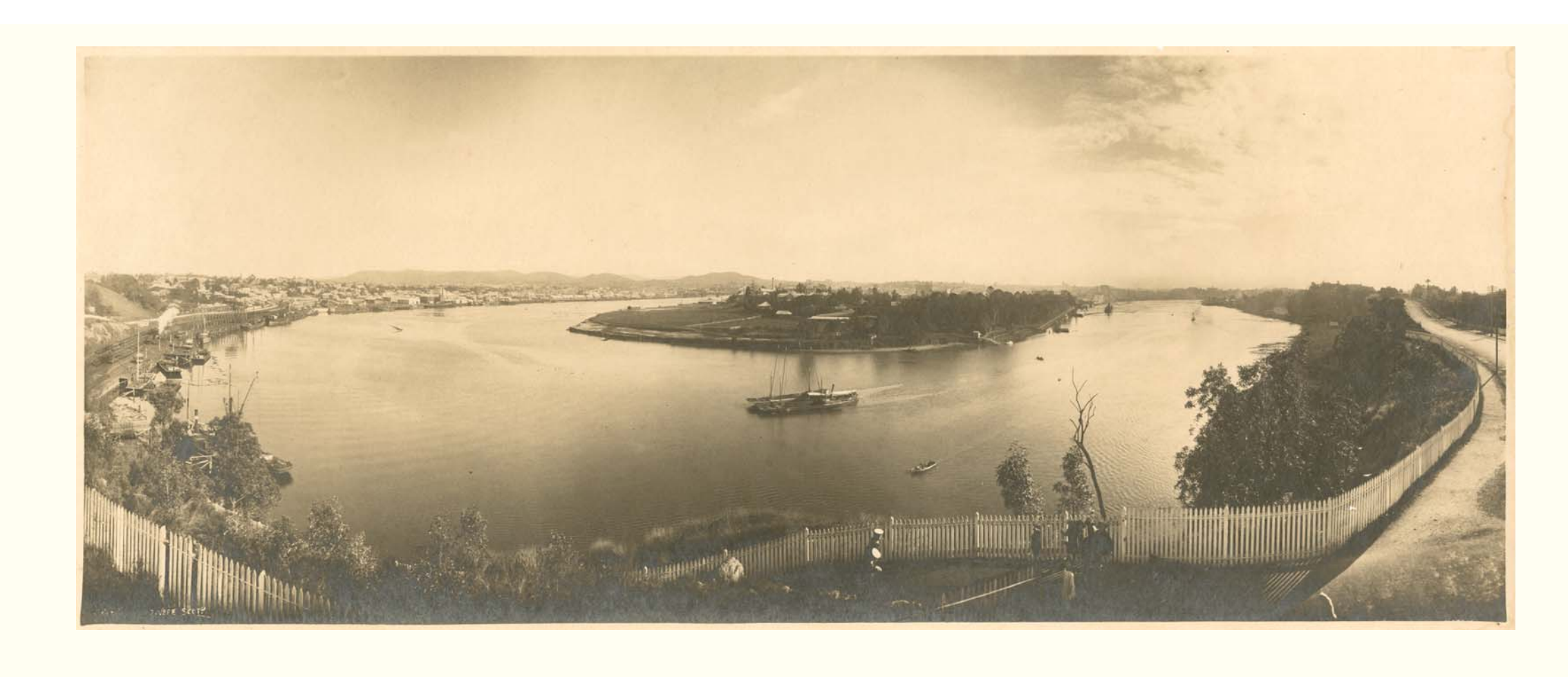
Panoramic view of Brisbane from River Terrace 1915