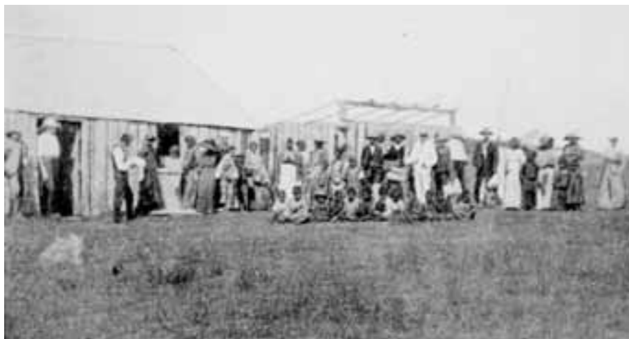
Above Photo taken in Barambah, Queensland, c.1907.