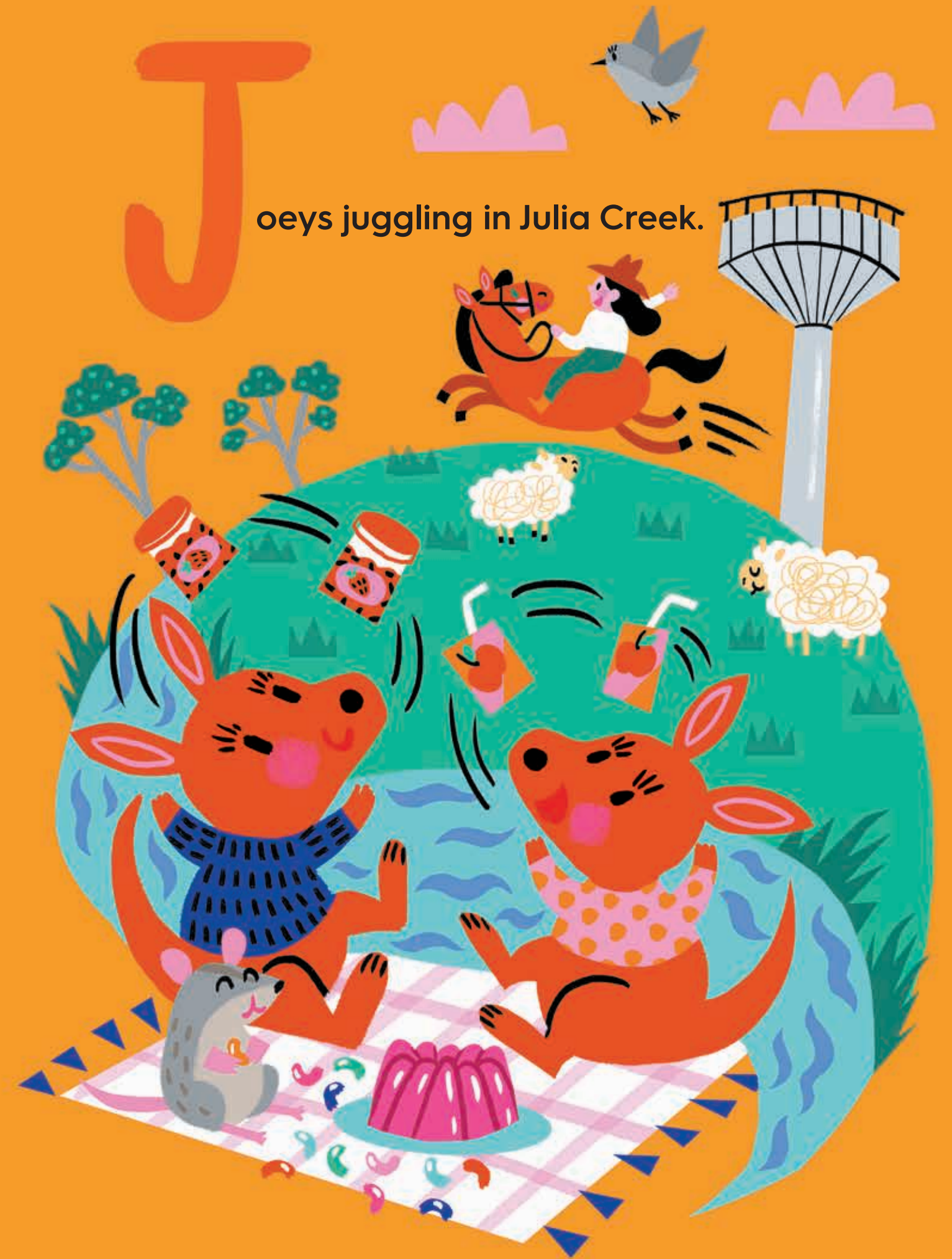
oeys juggling in Julia Creek.