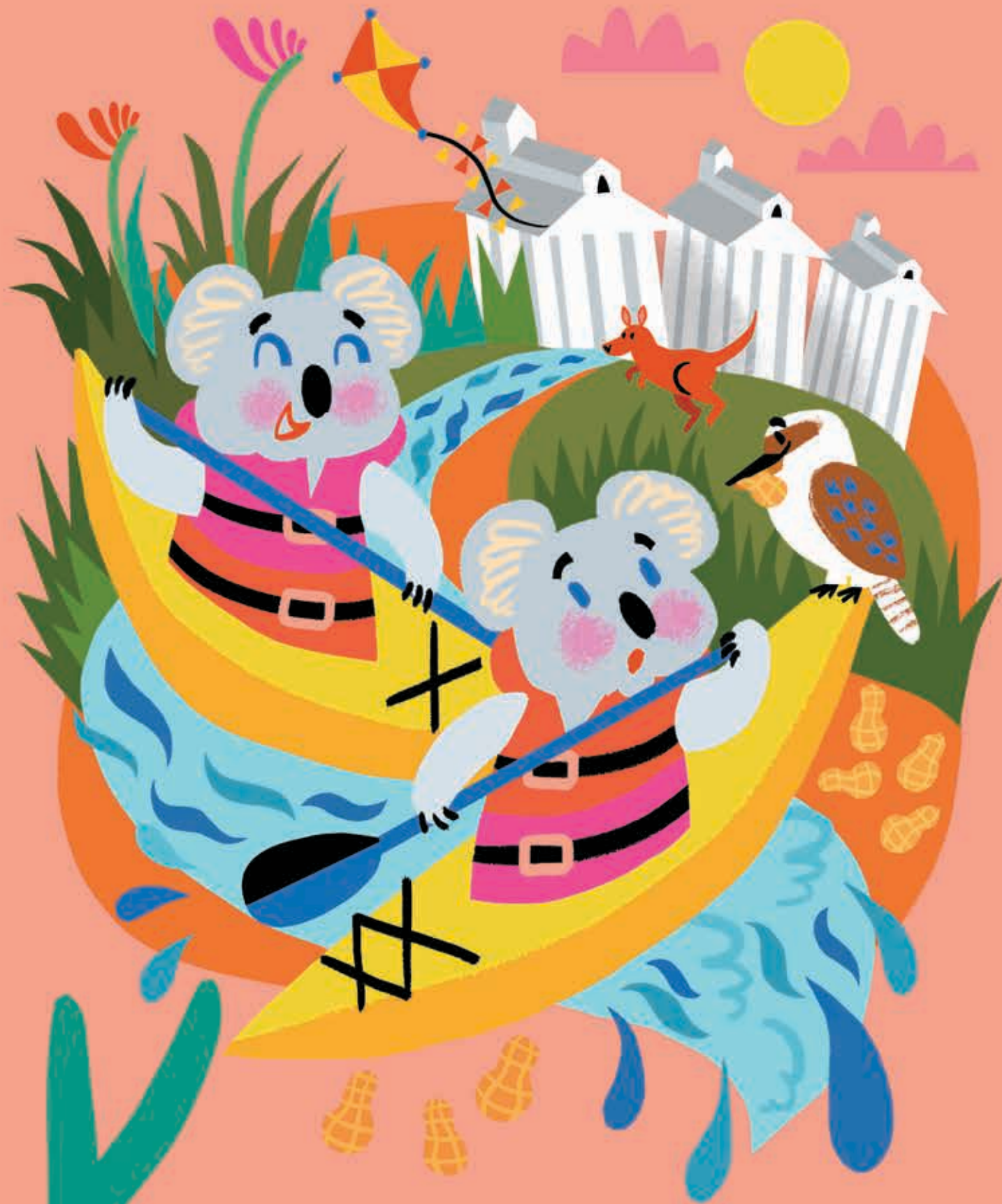
koalas kayaking in Kingaroy.