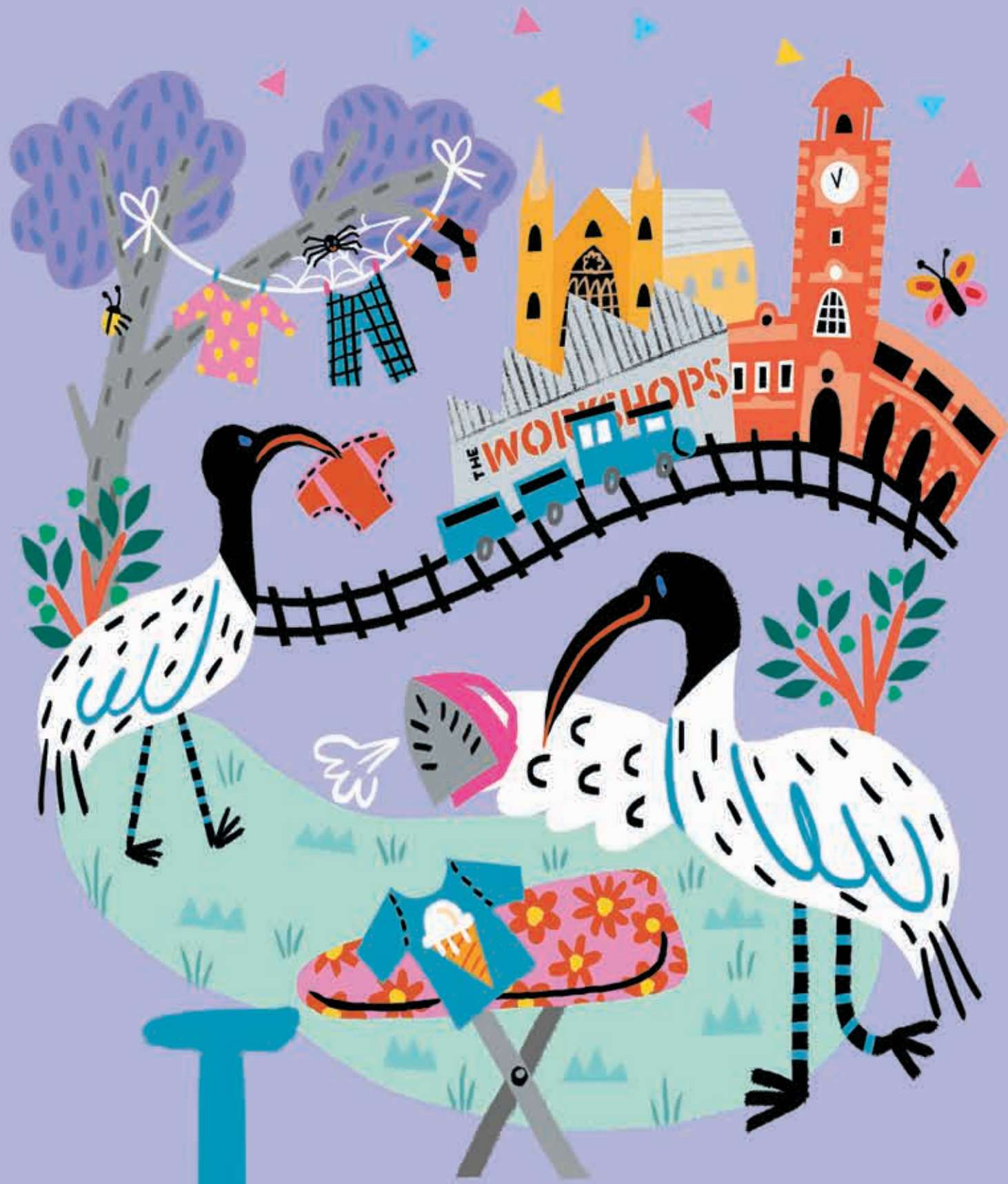
bises ironing in Ipswich.