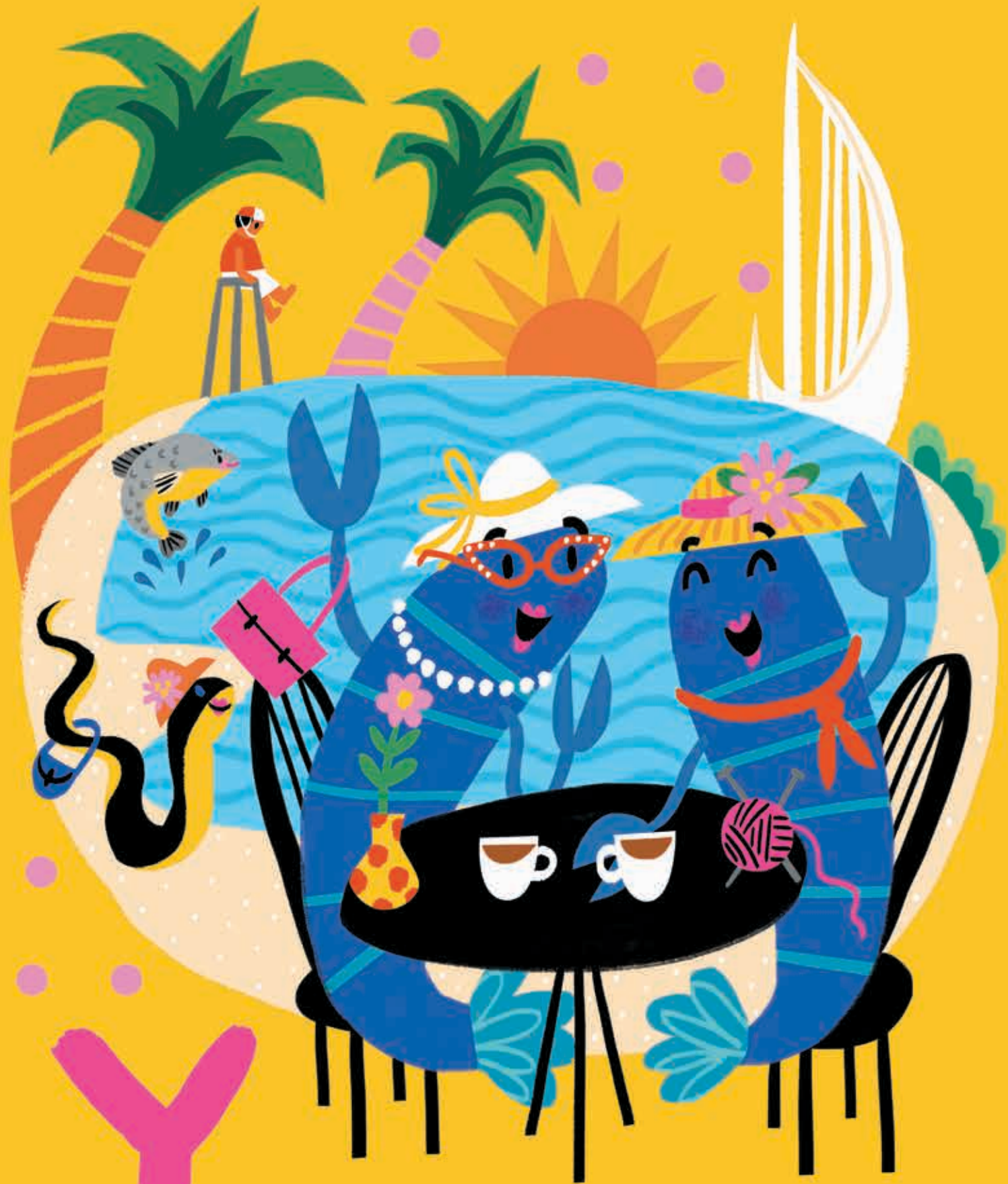
abbies yakking in Yeppoon.