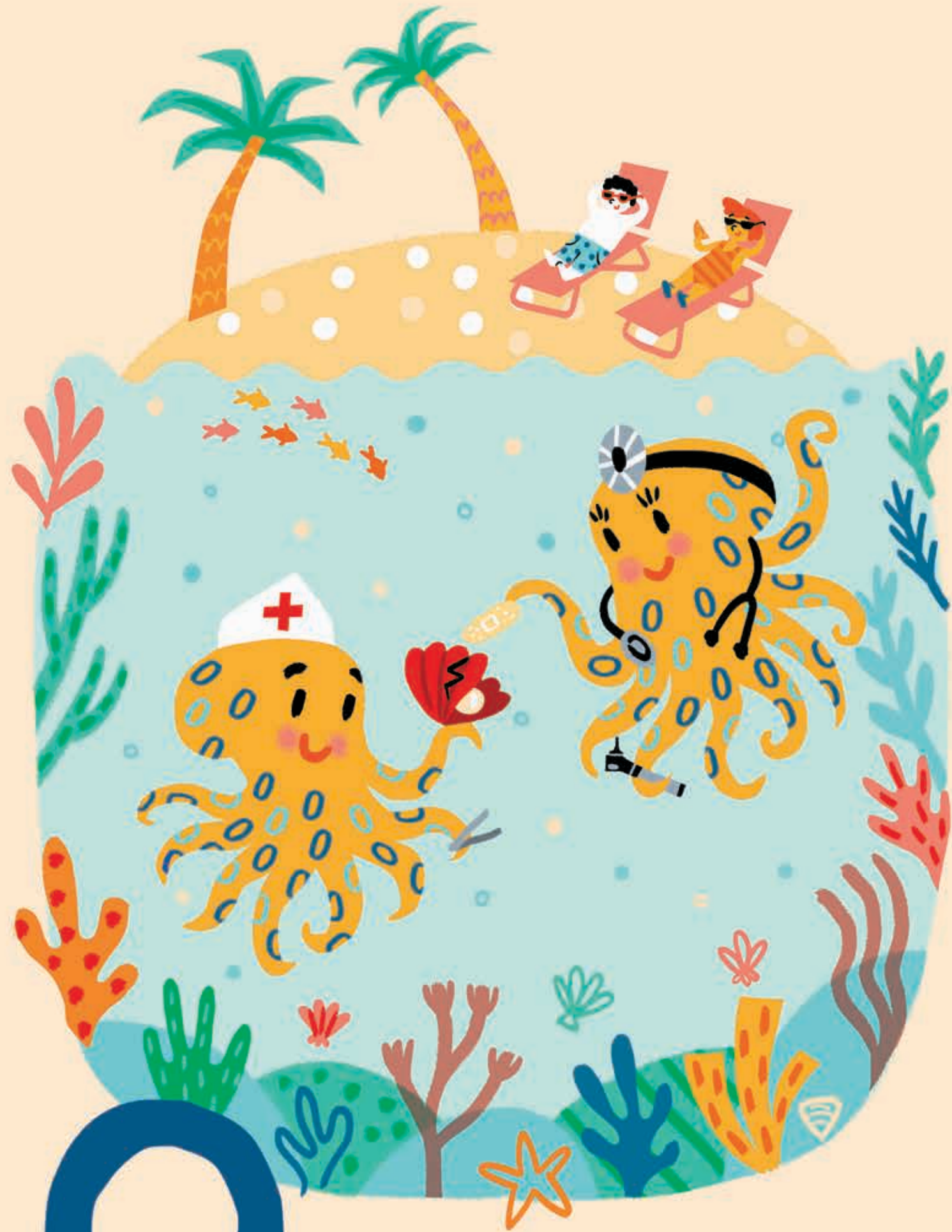
ctopuses operating on Orpheus.