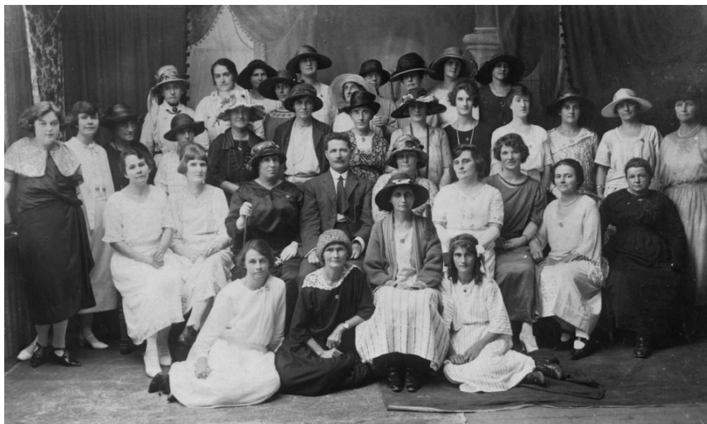
Inaugural meeting of the Country Women's Association in Bowen, 1923. John Oxley Library, State Library of Queensland, Negative No: 25762

As of 30 June 2020, 53,224 tags and 1,237 comments had been added by State Library of Queensland contributors in Trove.