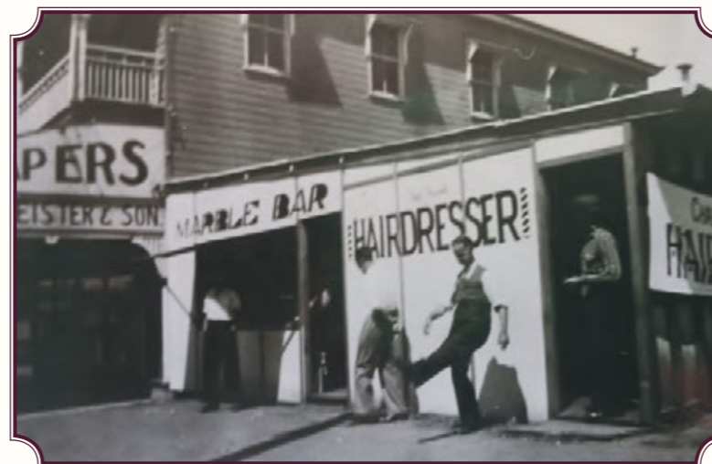
Temporary cafe and barber after fire, January 1940