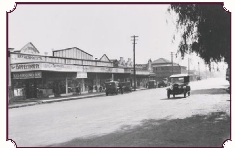
Section of Haly Street, Kingaroy, 1935