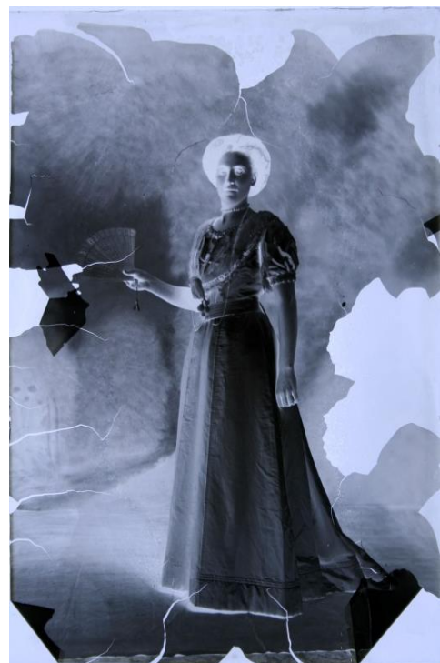
The damage on the glass plate negative (above) occurs when the gelatine emulsion swells and contracts in response to changes in humidity. The emulsion eventually lifts completely off the glass base causing large areas of image loss.