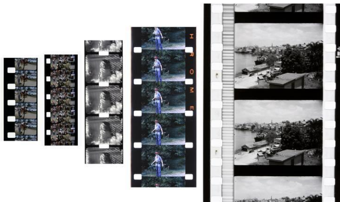
Common film gauges (left to right) standard 8mm, Super 8, 9.5mm, 16mm and 35mm

For over a hundred years, the motion picture film industry has created a legacy of different film gauges and film types, manufactured for both the domestic and professional markets. Personal and institutional film collections contain material in a range of conditions resulting from variables such as the original manufacturing and processing methods and materials, and storage and handling specifics. Understanding the effect these elements have on the physical and chemical properties of film is central to the long term preservation of motion picture film collections. This leaflet aims to provide general information for the care of film collections. For details on identification, deterioration, care, and storage of specific film types, refer to the additional resources listed.