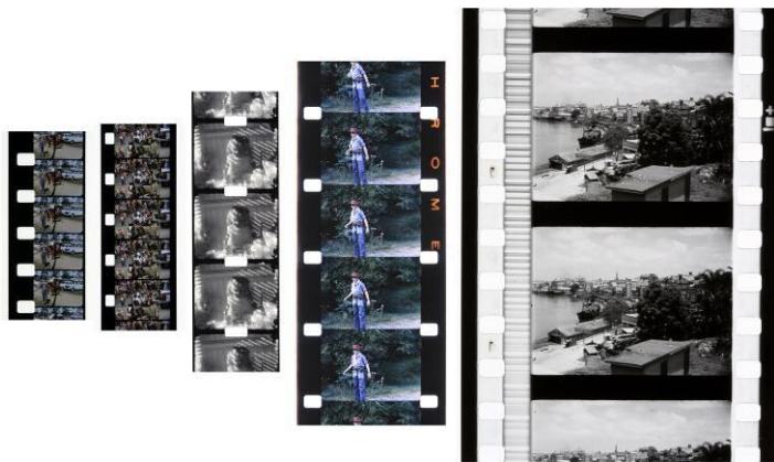
Common film gauges (left to right) standard 8mm, Super 8, 9.5mm, 16mm and 35mm

For over a hundred years, the motion picture film industry has created a legacy of different film gauges and film types, manufactured for both the domestic and professional markets. Personal and institutional film collections contain material in a range of conditions resulting from variables such as the original manufacturing and processing methods and materials, and storage and handling specifics. Understanding the effect these elements have on the physical and chemical properties of film is central to the long term preservation of motion picture film collections. This leaflet aims to provide general information for the care of film collections. For details on identification, deterioration, care, and storage of specific film types, refer to the additional resources listed.