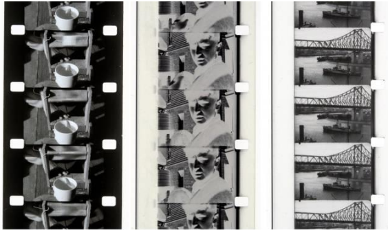
Reversal (camera original positive, solid black edge), Negative copy (clear edge), Print (clear edge or solid black edge depending on printing)