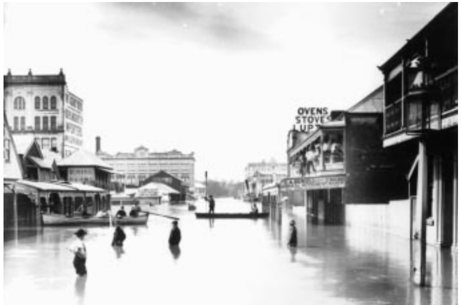
Albert Street Brisbane during the 1893 flood.

During 1996/97 financial year the State Library generated income of $1 852 000 through its Trust Fund operations. Principal revenue sources included reproduction services, interest earnings, book sale proceeds, Foundation Grants and revenue from commercial services. This program provides funds to support