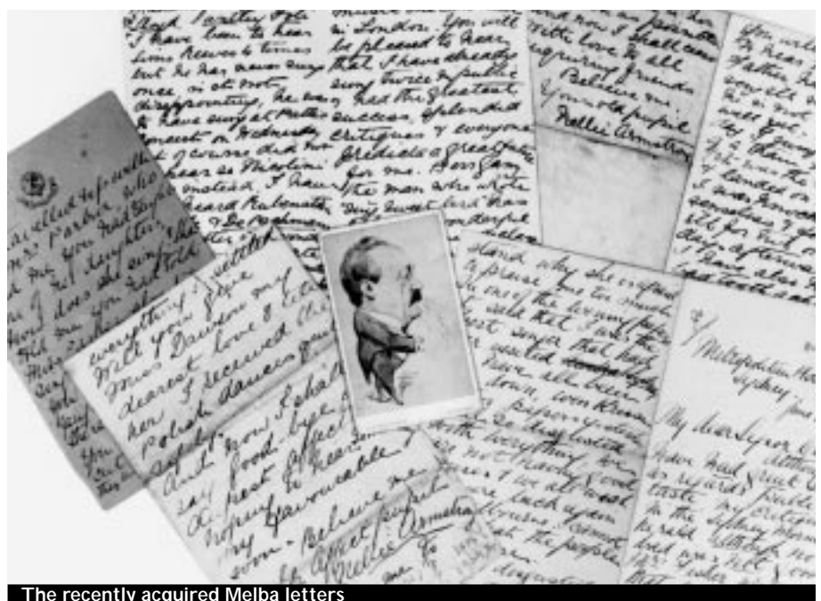
The recently acquired Melba letters

During 1997/98 the State Library will continue to plan its requirements in the State Government's proposed Cultural Heritage Centre in Brisbane. As a leading custodian of the State's cultural heritage, the Library will continue to build its collections in this area. Throughout the year the Library will continue to use