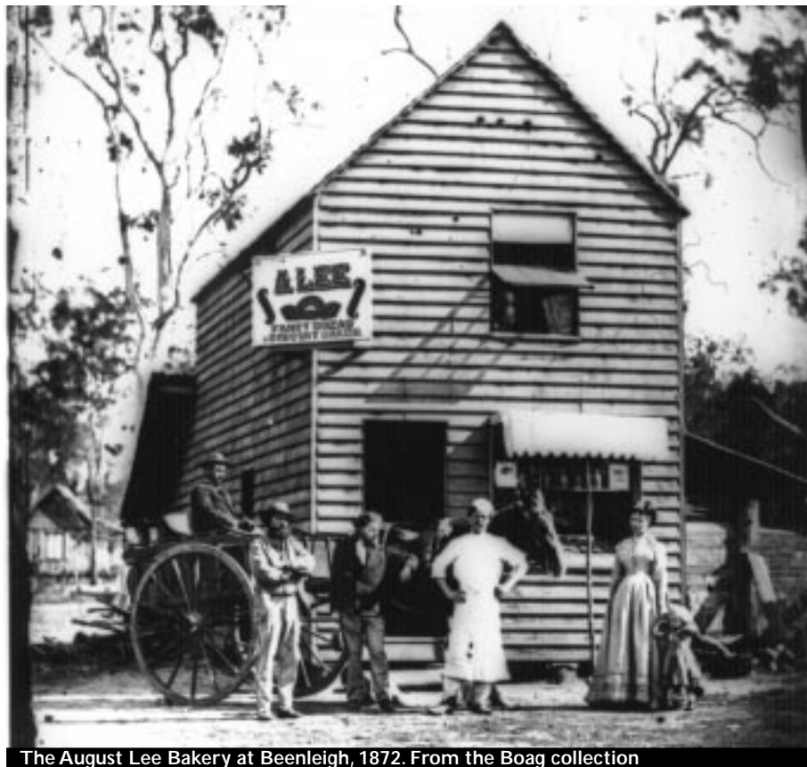
The August Lee Bakery at Beenleigh, 1872.

The John Oxley Library is ensuring that major daily Queensland newspapers are made available to the public on microfilm. Further funds are required, however, to ensure essential parts of our history are preserved.